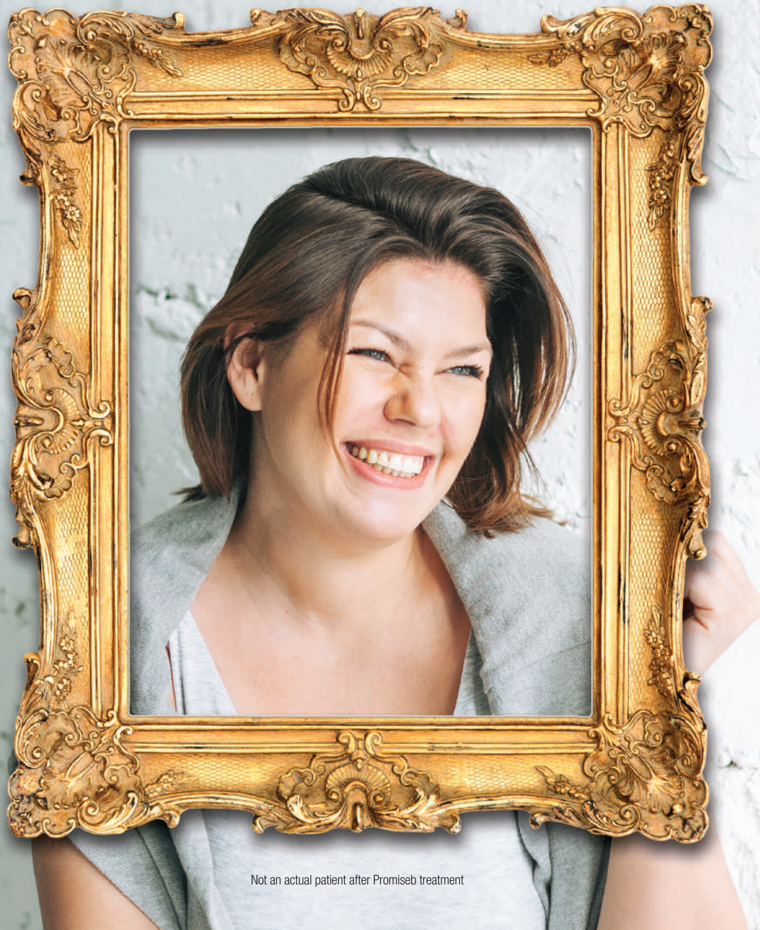
Not an actual patient after Promiseb treatment

For the management and relief of the signs and symptoms of seborrheic dermatitis, such as scaling, erythema, pruritus, and pain. Promiseb® Topical Cream helps to relieve dry waxy skin by maintaining a moist wound environment, which is beneficial to the healing process. 1